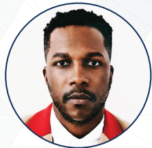
LESLIE ODOM JR.